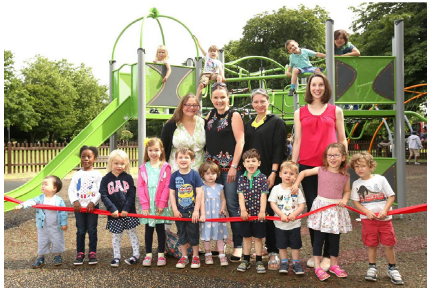
Children's Play Area Christchurch Green