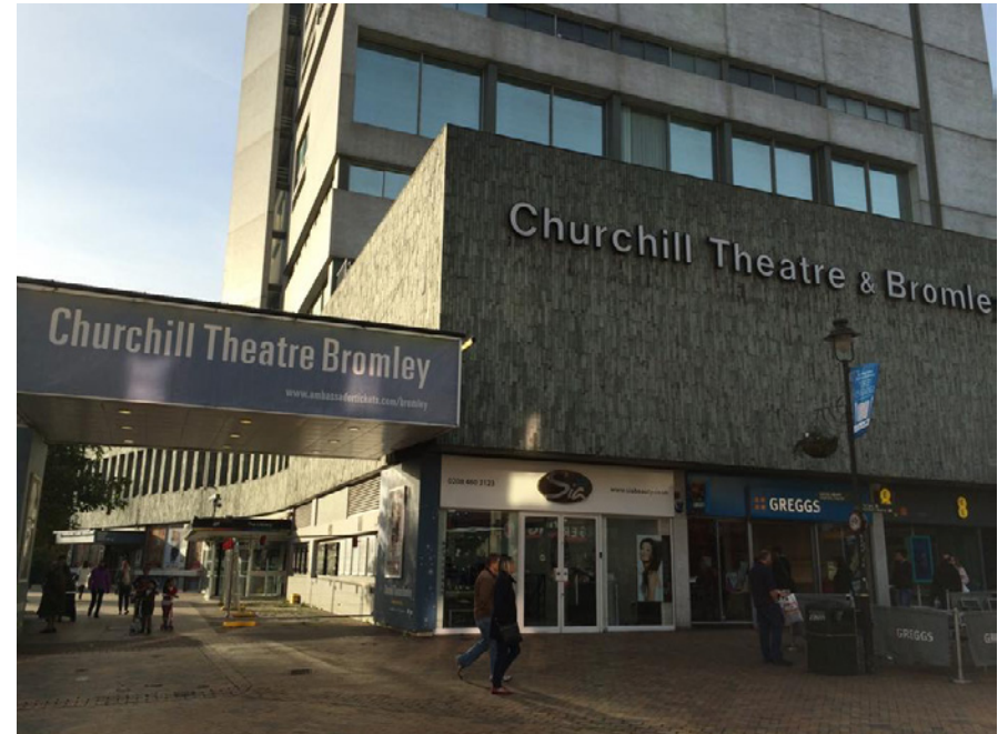
Churchill Theatre opened 1977 (same building as Library)

I've gone to the pantomimes here for as long as I can remember