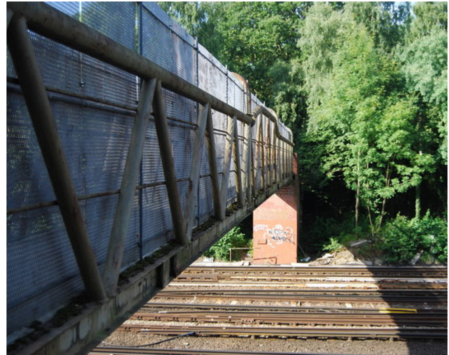
footbridge over Petts Wood line bridge here since around 1980

All the kids wave to the train drivers, they toot the horn if you're lucky