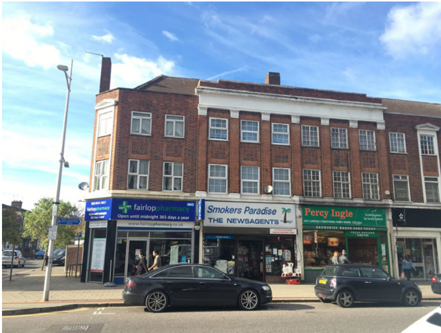
Fairlop High Street