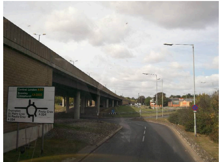
The Sidcup Bypass crossing the A224 aka Crittall's Corner completed 1986

The place you fear the most when you're learning to drive