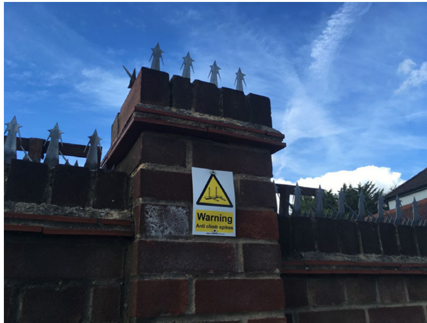
high security suburbia