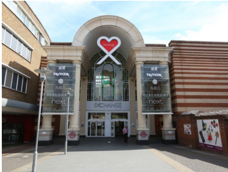
Exchange Ilford 90 shops opened 1991