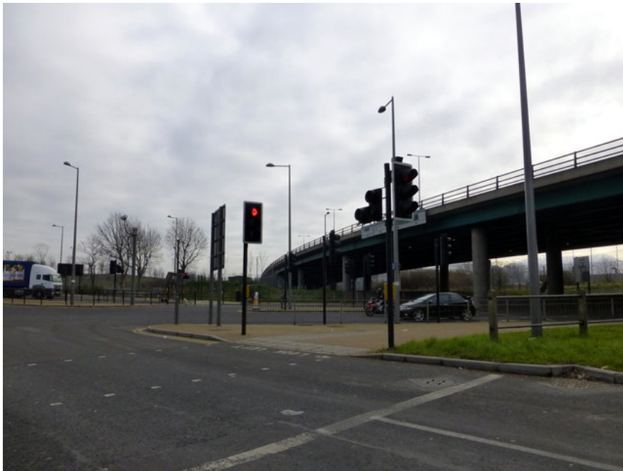
The North Circular crossing the A12 aka Redbridge Roundabout completed 1987