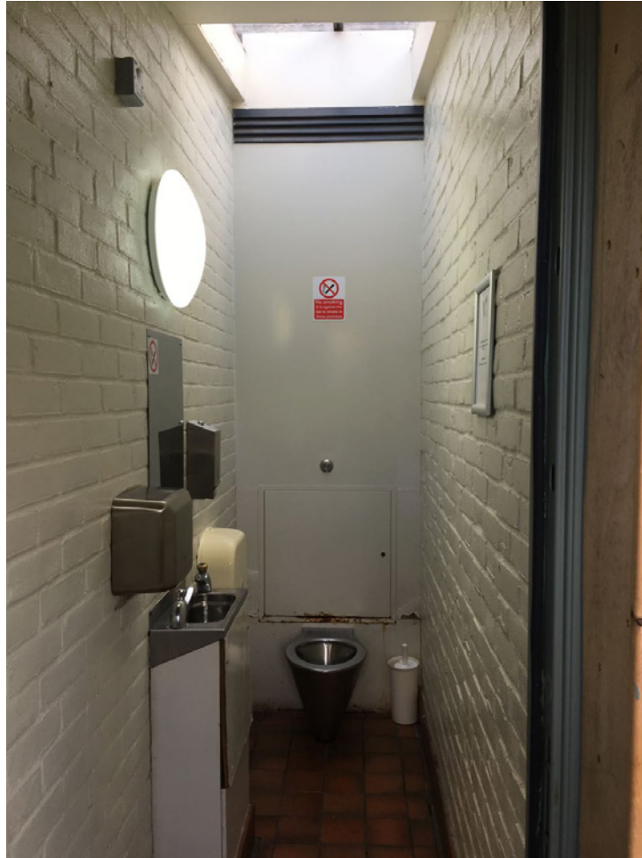
very nice public toilets at Valentine's Park