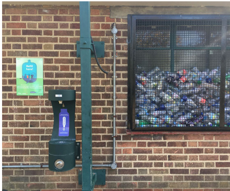
a window full of plastic bottles advertising a drinking fountain