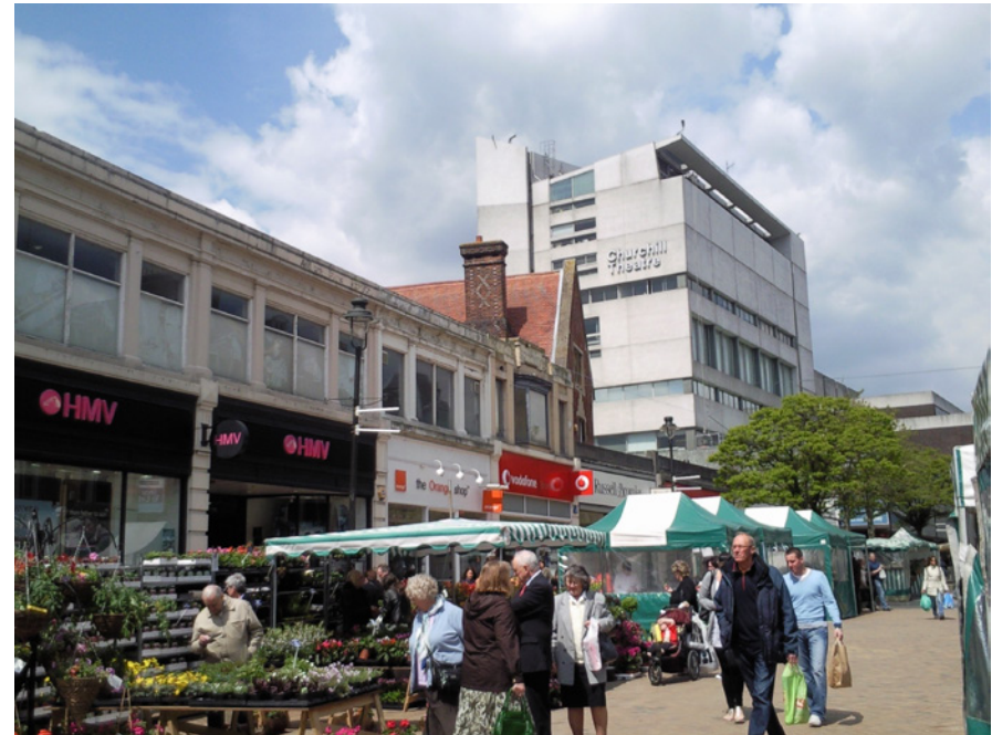
Bromley High Street and Market active market since 1205

market is good for cheap christmas presents Topshop and Primark are main attractions