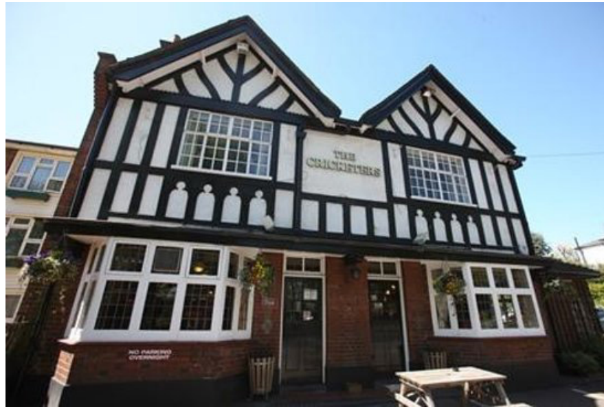
The Cricketers Woodford Green