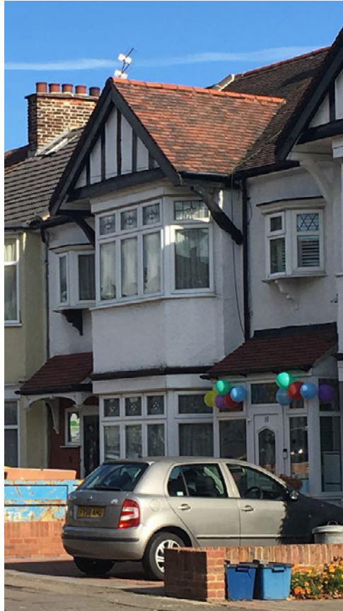
balloons on a front door that mean there's a party