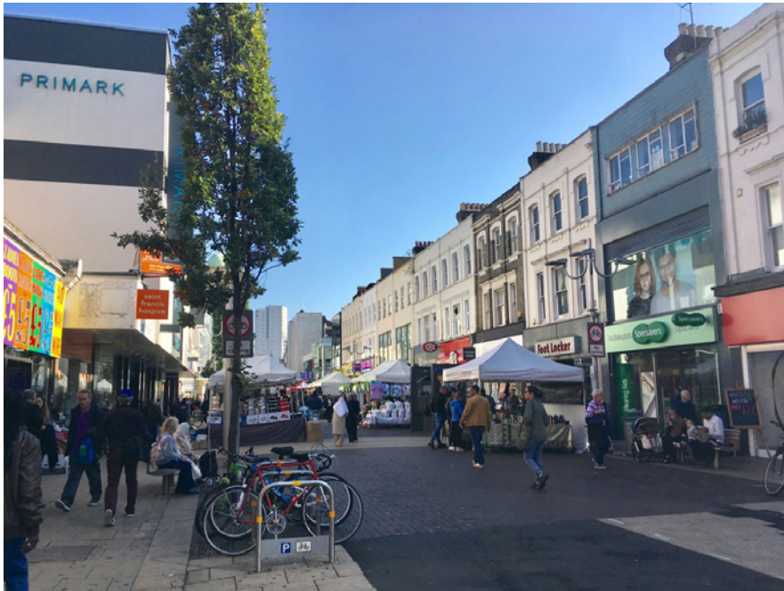
Ilford High Road and Market town centre since late 1600s