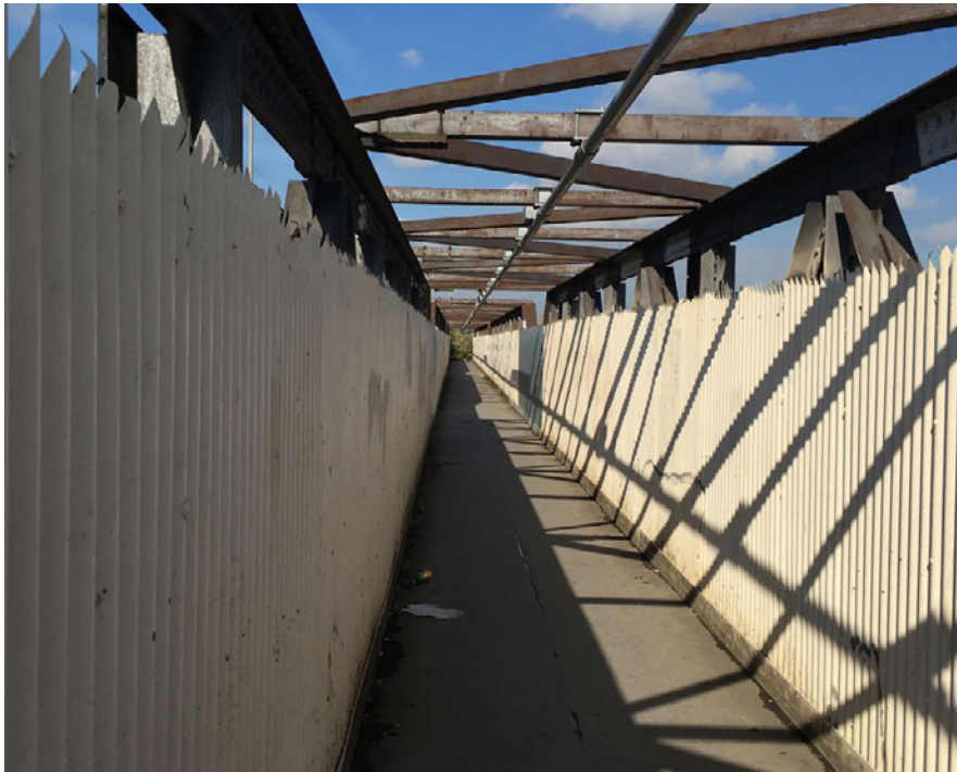
footbridge over Seven Kings line bridge here since around 1890