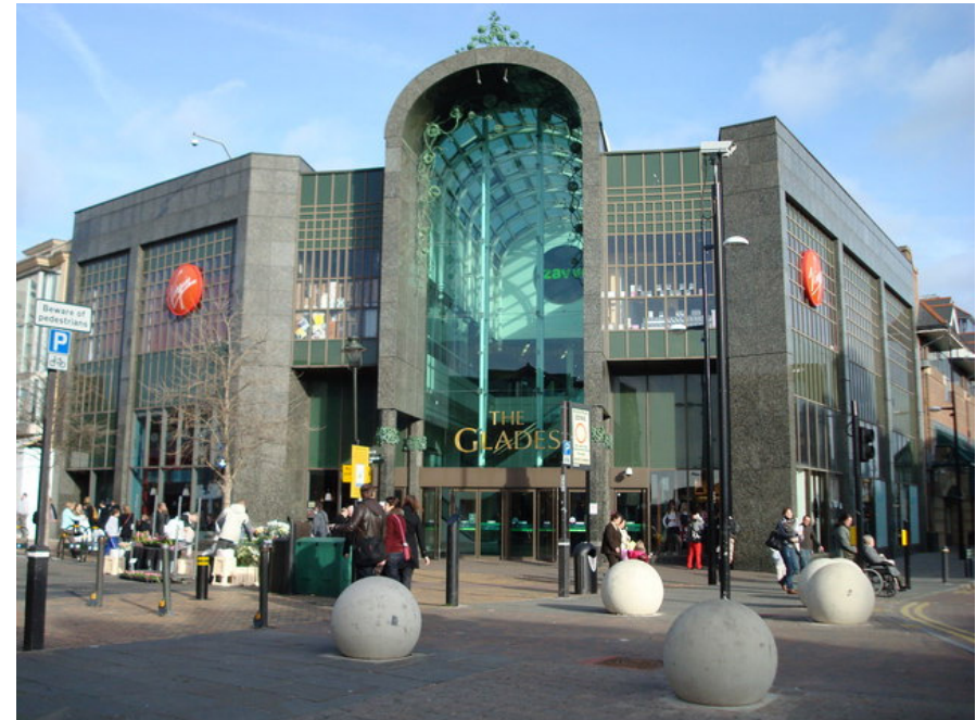
The Glades 135 shops opened 1991

Going shopping there after school, on the weekend, meeting friends. There was collective dismay when it turned to 'intu Bromley' and relief when it reverted