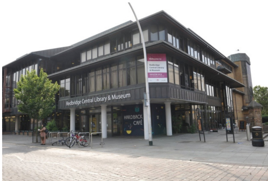
Redbridge Central Library run by Vision Redbridge, Culture and Leisure opened 1986