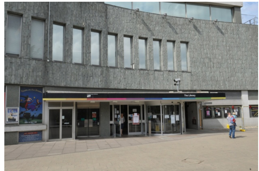
Bromley Central Library run by Greenwich Leisure Limited opened 1977

Always packed around exam season - my friends tell me, I never used it much