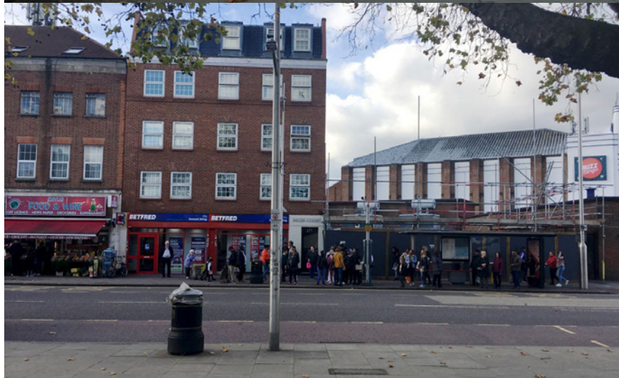
newly redone public space, much less buzzing than the bus stop opposite