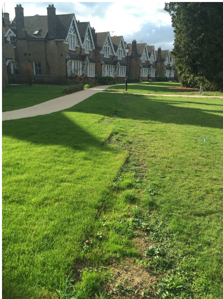
new turf at Barnado's cottages (dreamy but no proper path out to get to Sainsbury's)