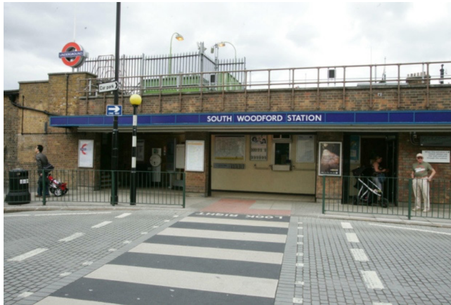
Central Line Underground