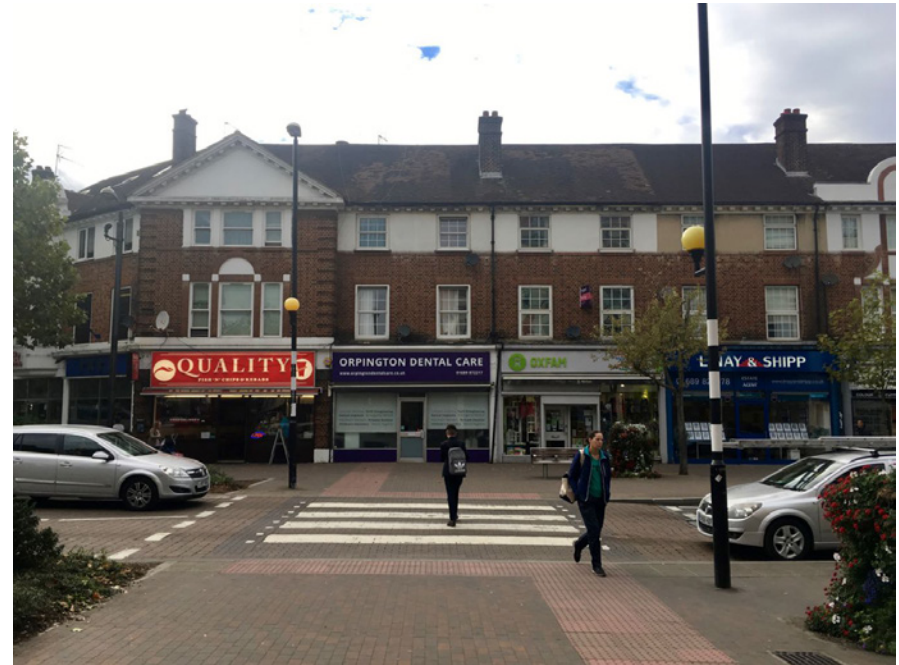
Orpington High Street

A charity shopper's paradise. Some great restaurants too, a new cinema and even a Nandos nowadays