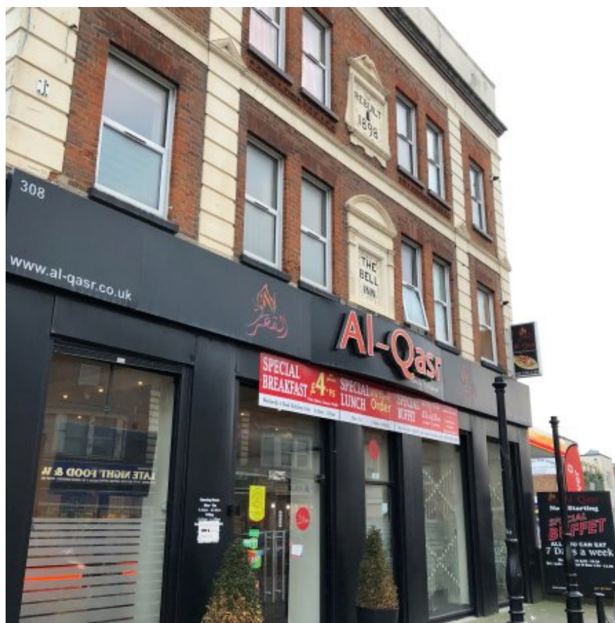
Al-Qasr family restaurant/The Bell Ley Street