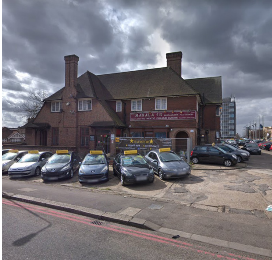
The Avenue/Masala 910 Eastern Ave closed