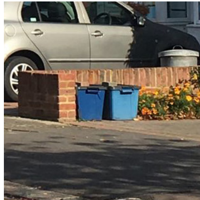
the bins are blue instead of green