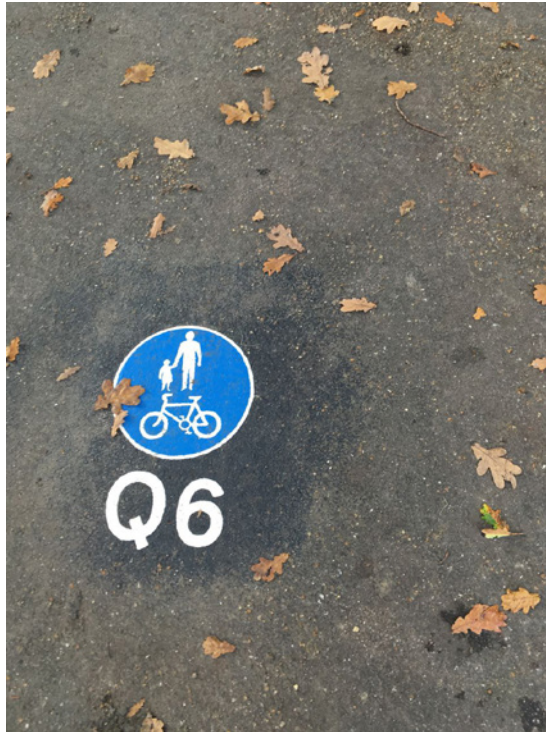
A new quietway cycle route through Valentine's park