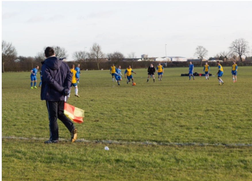
Oakfield Playing Fields Fencepiece Rd