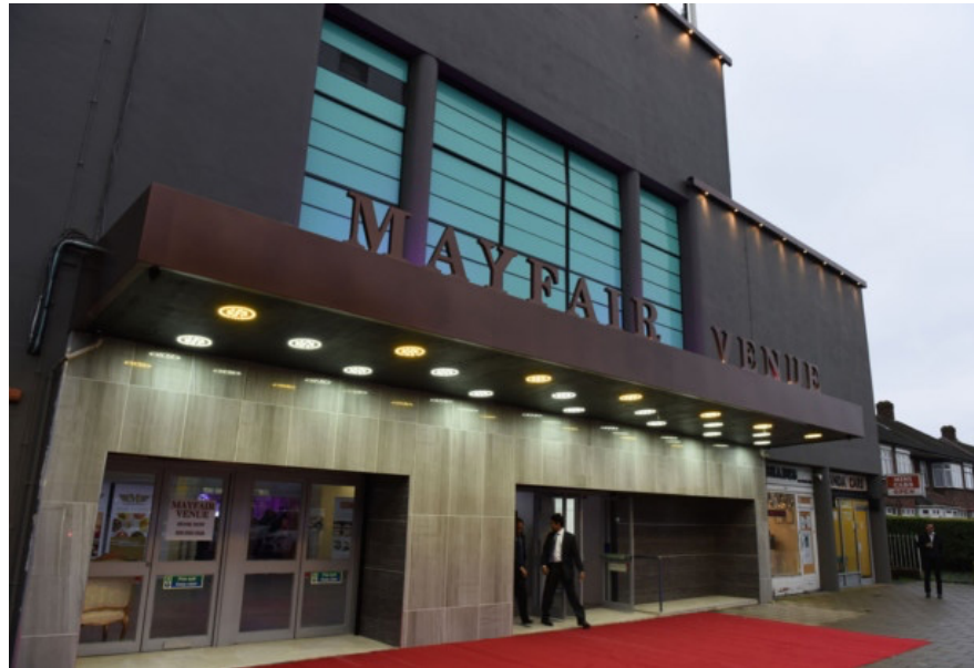
Mayfair Venue Chadwell Heath