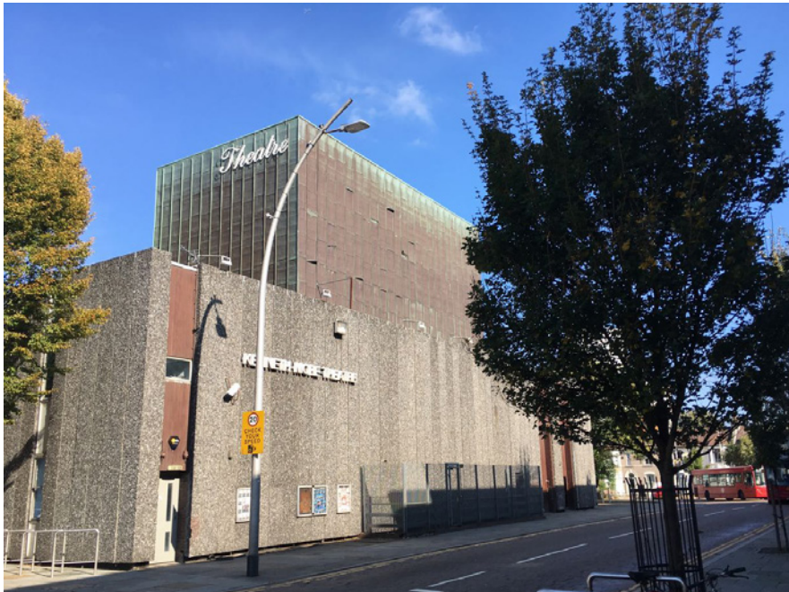
Kenneth More Theatre opened 1975